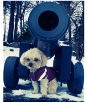
Our newsletter co-editor and his cannon, with which he plans to fight city hall.